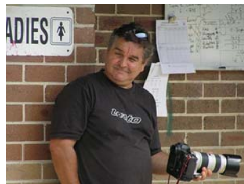
Who's this lurking outside the Ladies toilet with a camera? Go to page 9 for the answer